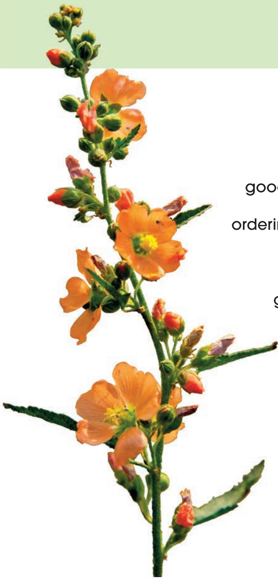
Yerba de la Negrita