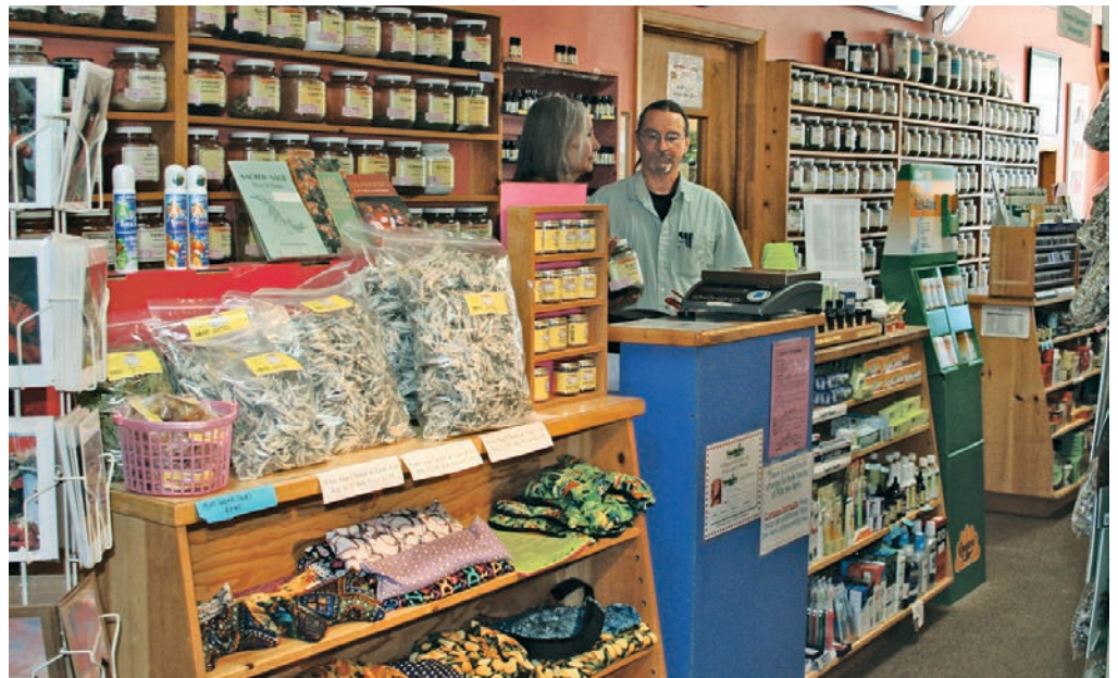
Our retail store in Taos, New Mexico